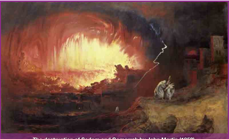
The destruction of Sodom and Gomorrah by John Martin (1852)

So I says to the editor I won't be submitting anything this month. The days fly by so fast and these submissions interfere with my plans for world domination.